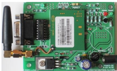
Figure 3. GSM SIM 300 Module

GSM stands for Global System for Mobile Communications; it is used as an information transmission module. We will use GSM SIM 300 Module for the proposed system and its figure is shown below.